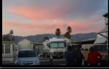
What a Spectacular Evening !