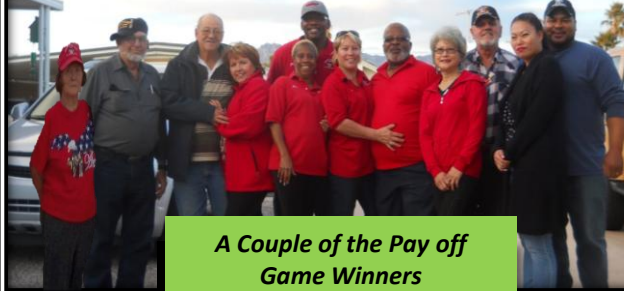
A Couple of the Pay off Game Winners