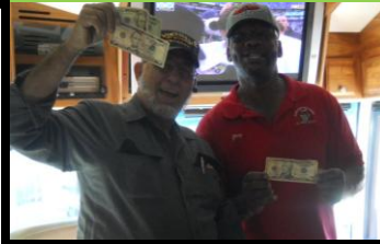
A Couple of the Pay off Game Winners