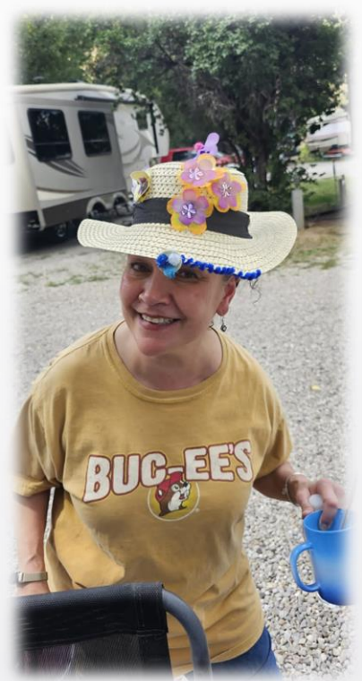
Modeling our art