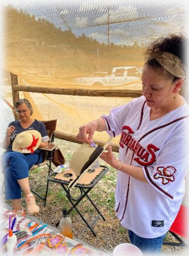
A touch of detail