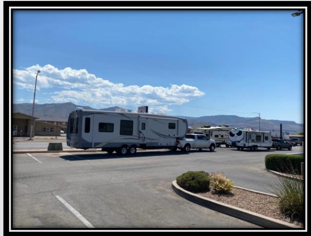
Caliche's Frozen Custard stop on the way home