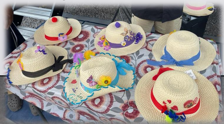
Final works of art