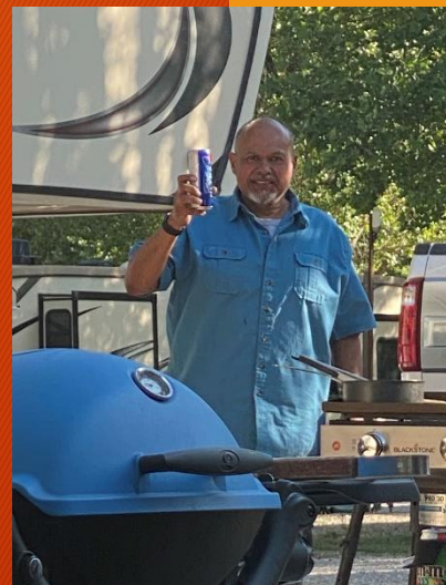
Cheers to the best grill chef!