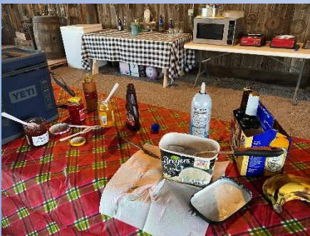
Banana split fixings