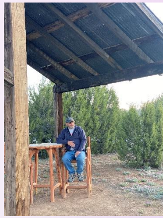
Having a seat at the new dog walk area