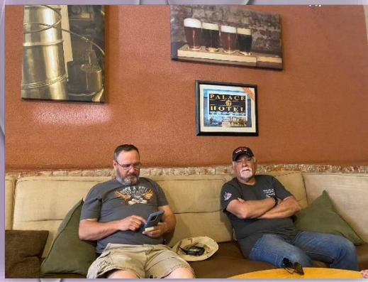
Waiting on the "smart blondes"