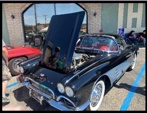
A local car show for the car enthusiasts in our group. Red seemed to be a popular color.