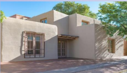
Georgia O'Keeffe Museum