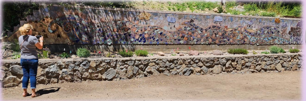
The explanation of the flood (in mosaic tile work) which ultimately led to the Big Ditch