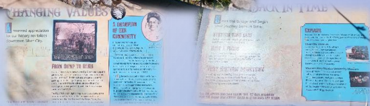
dump to the creation of the Big Ditch (park)