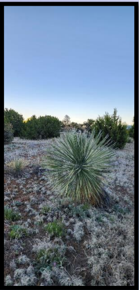
Morning stroll views -