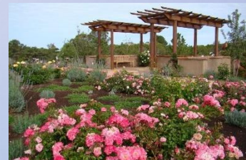
Santa Fe Botanical Garden