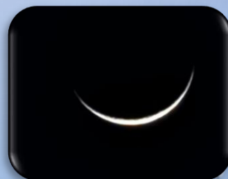
Awesome crescent moon Friday evening