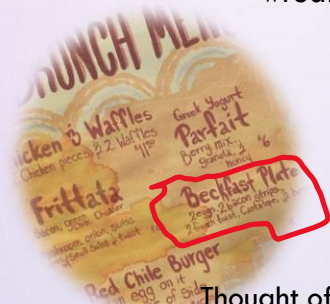
Thought of you, Edgar