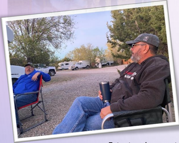
Enjoying the evening