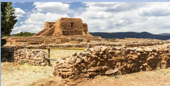
Pecos National Historical Park