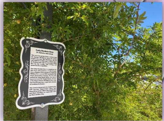
Interesting history behind this rose