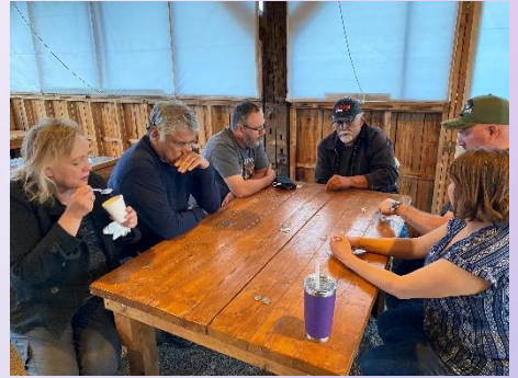
A game of Left, Right, Center