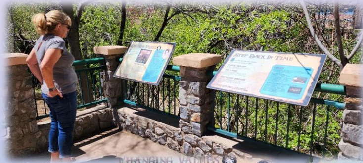
From Main Street to a