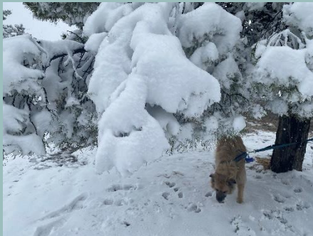
Beware of falling snow, Chewie!