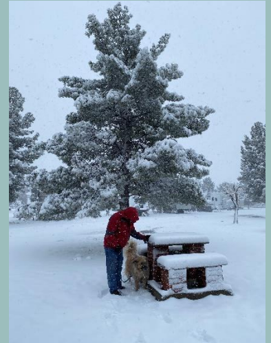
No, Chewie! No grilling today!